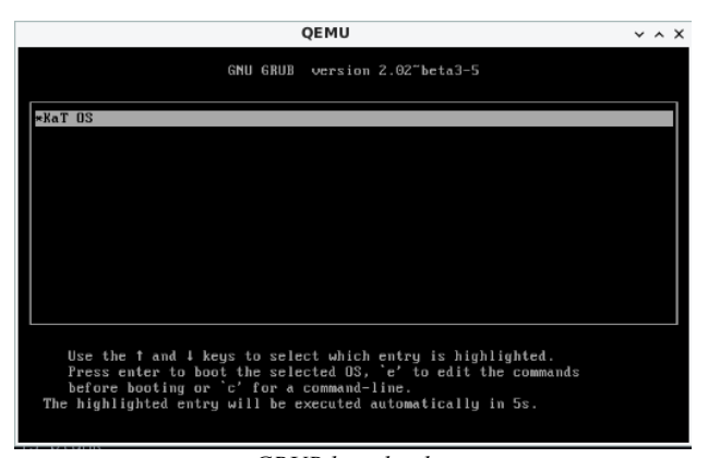
GRUB boot loader

Grub moves kernel into protected mode that allows system software to use features such as virtual memory, paging and safe multi-tasking designed to increase an operating system's control over application software.